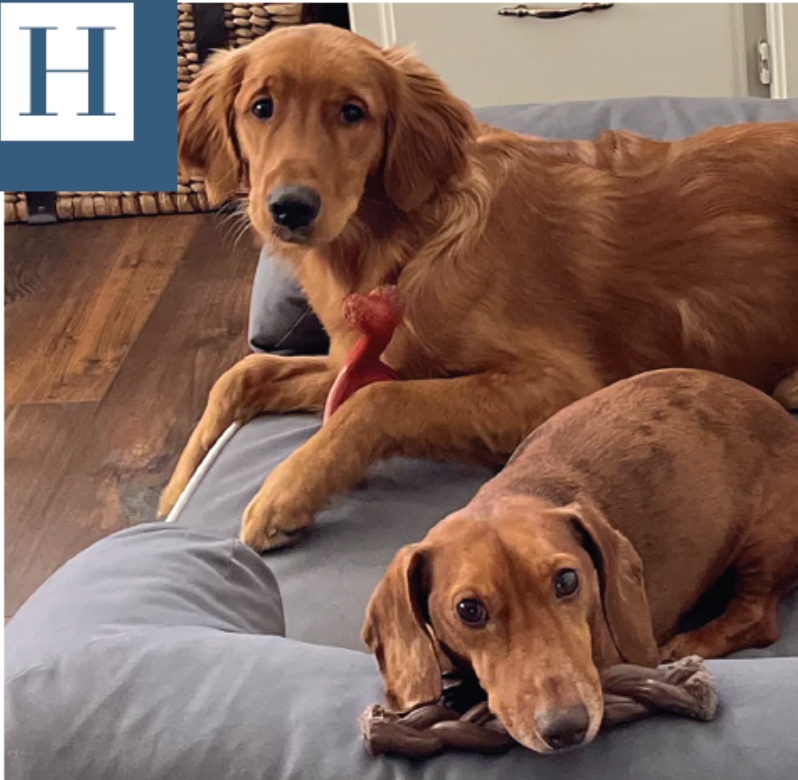
Tucker (Golden Retriever) and Bandit (Daschund)