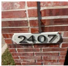
On the curb